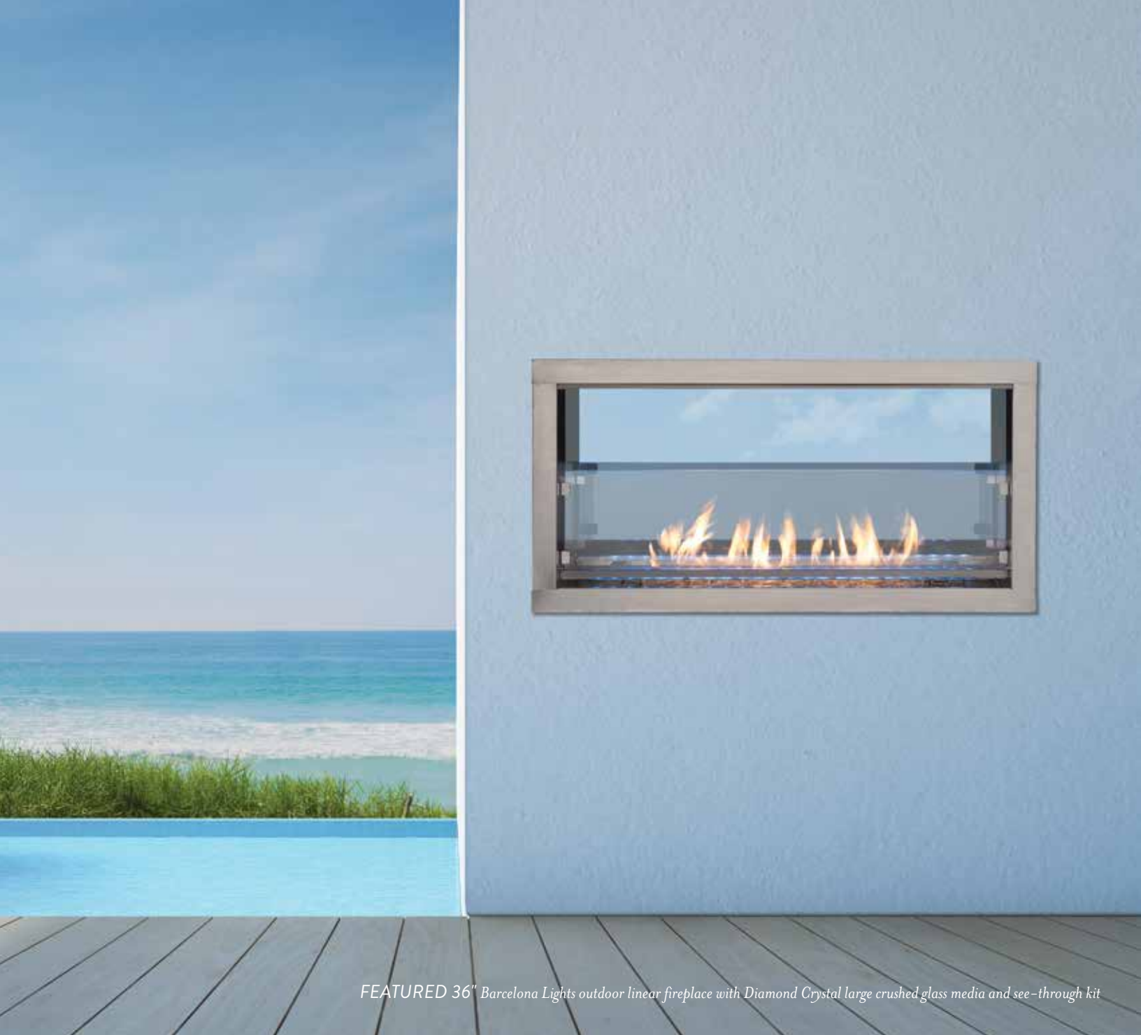
FEATURED 36" Barcelona Lights outdoor linear fireplace with Diamond Crystal large crushed glass media and see-through kit

The Barcelona Lights linear fireplace offers a customizable look for any outdoor living space. Set the mood or match the season with interior LED lights and flames dancing on a bed of large crushed glass. Weather-resistant stainless steel construction offers both durability and eye-catching appeal to outdoor spaces. Each Barcelona Lights fireplace allows single-sided or optional see-through installation.